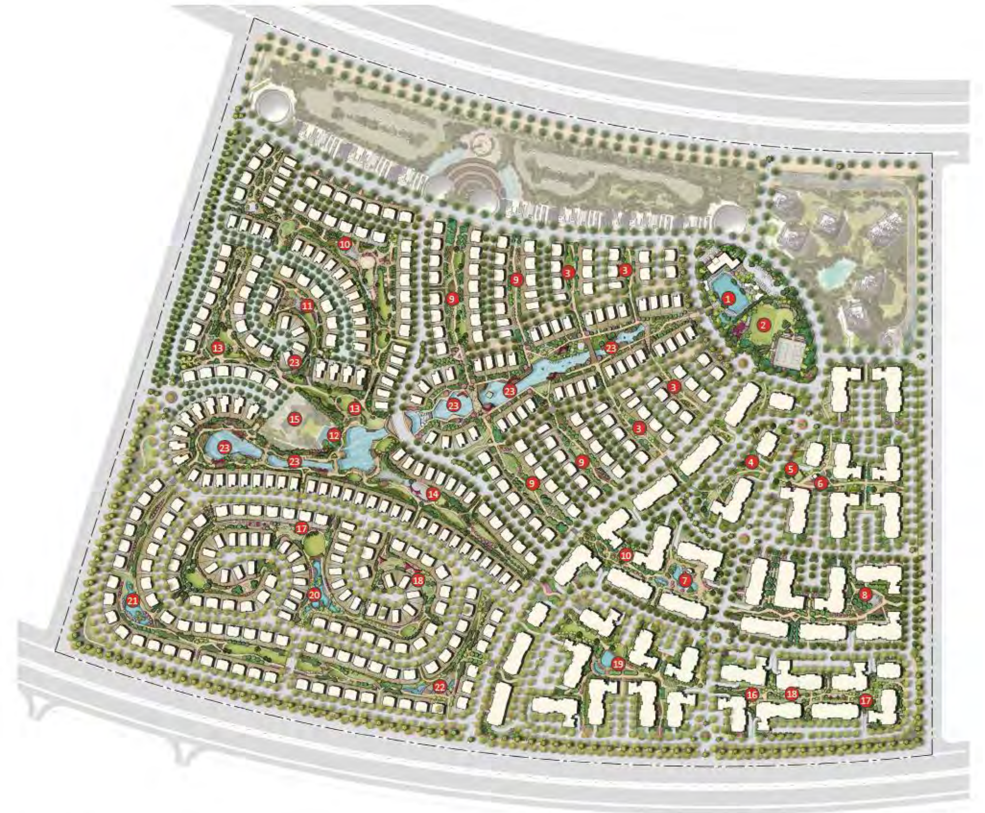
Figure 2. Masterplan